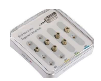
3Shape (BI3, BIY, BIG, BIB)