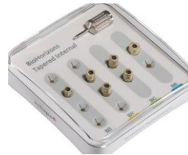
3Shape (BI3, BIY, BIG, BIB)